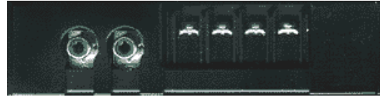
R LINE L IN R+ R- L+ L- SPEAKER OUT